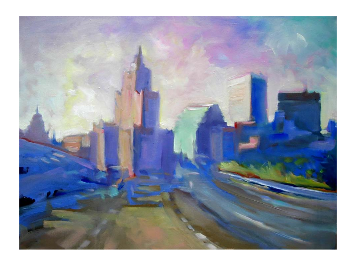
Fiscal Year 2009